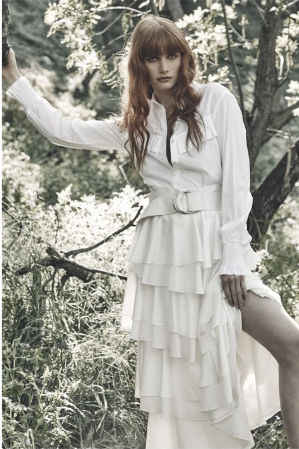
Skirt FOLIE A DEUX Belt DINT @dintofficial