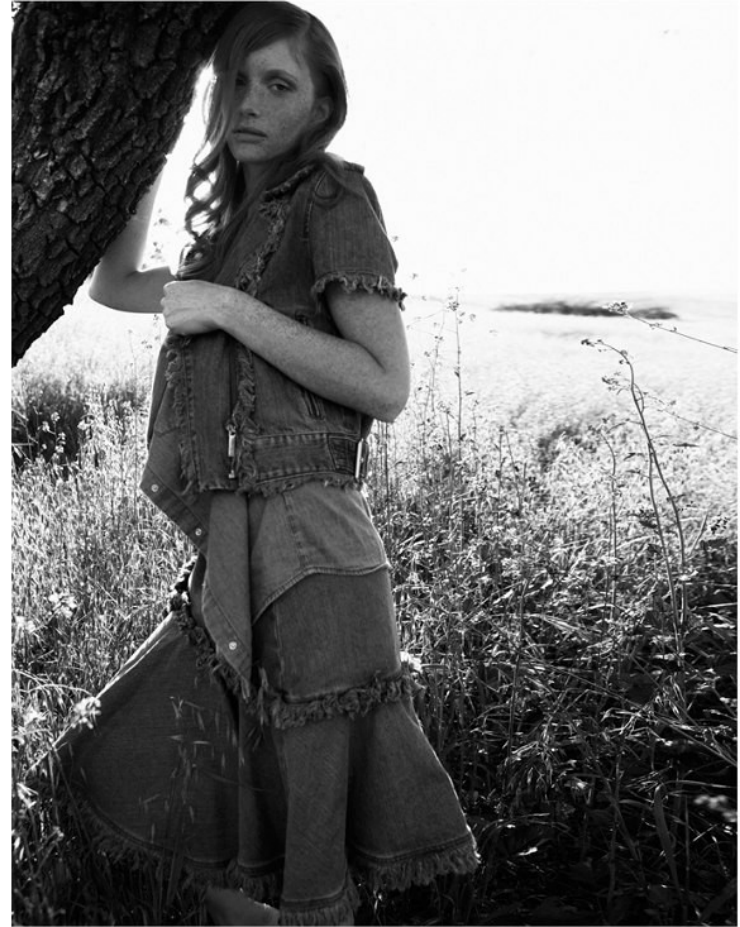
Biker vest & skirt, by MICHAEL Michael Kors. Shirt, by Calvin Klein Jeans.