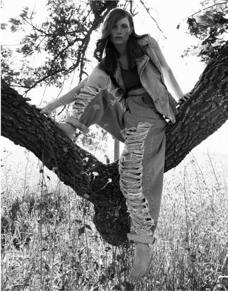
Denim biker vest, by Rag & Bone. Crop top, by 69 US. Customised vintage Versace jeans.