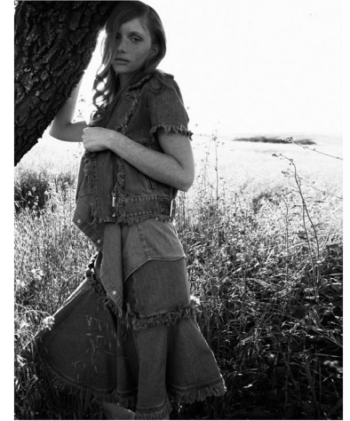
Model shot by A. M. C. Creative