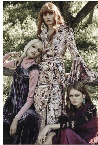
(left) Dress RAQUEL ALLEGRA @raqueallegra Turtle Neck CHARLES AND RON @charlesandron (center) Neck Floral Print Dress DINT @dintofficial Mesh Skirt Ring SUTRA JEWELS @sutrajewels Earrings JACQUE ACHIE @jacqueachie (right) Top ANGEL'S BALEN NEW YORK @angelsbalen Dress VINTAGE Earrings SUTRA JEWELS @sutrajewels