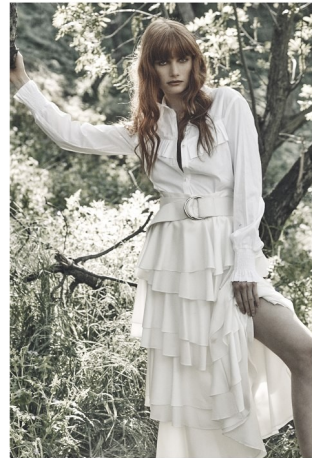
Shirt POLIE A DEXU Belt DINT @dintofficial