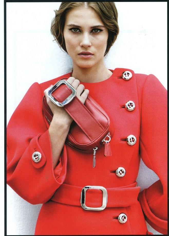
Manteau ceinturé en gabardine natto et pochette en cuir saffiano, le tout Prada