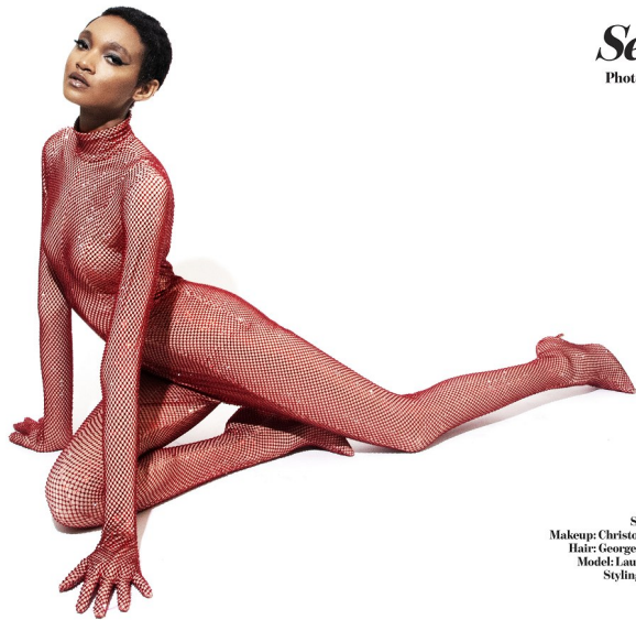
Sensation