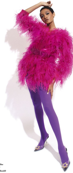
Top by Le Think Blue Tights by Wolford Shoes by Jimmy Mendel